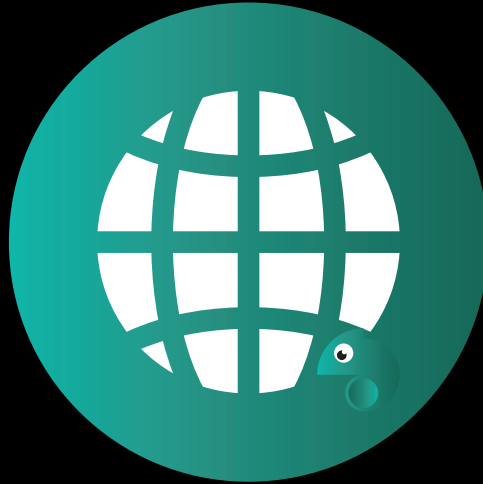
GET A WEBSITE