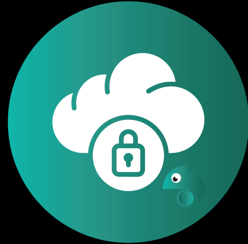
GET POPI HELP