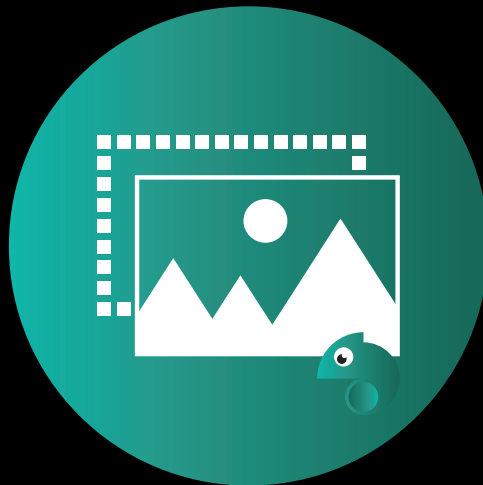
GET A DESIGN