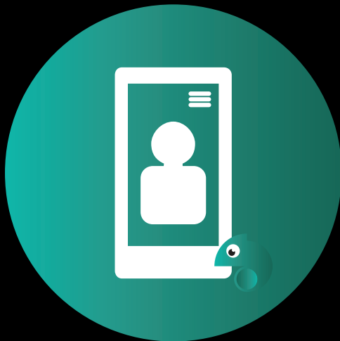
GET A MEISHI CARD